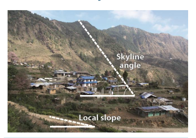
Figure 1. Landslide-prone houses in Sindhupalchok District, Nepal, showing the difference between the maximum angle to the skyline and the local slope of the ground surface.

The single most effective way to reduce exposure to earthquaketriggered landslides is to minimise the 'skyline angle': the steepest angle from your location to the skyline