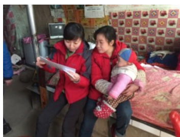
Door to door interviewing