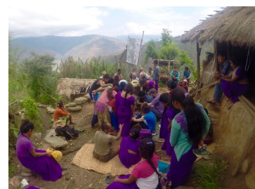
Focus group land slide risk