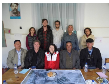
Focus group with rural elders